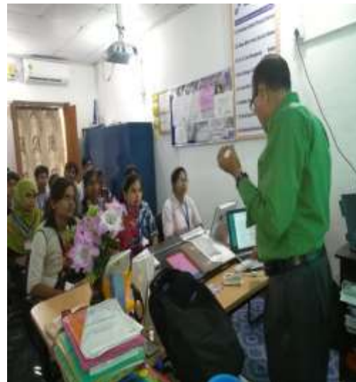
Teaching through Smart Classroom